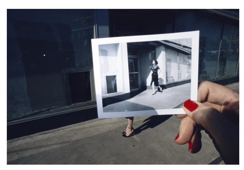
Guy Bourdin's 'Charles Jourdan 1978' (1978)

The Polaroid camera provided fertile ground for creative invention.